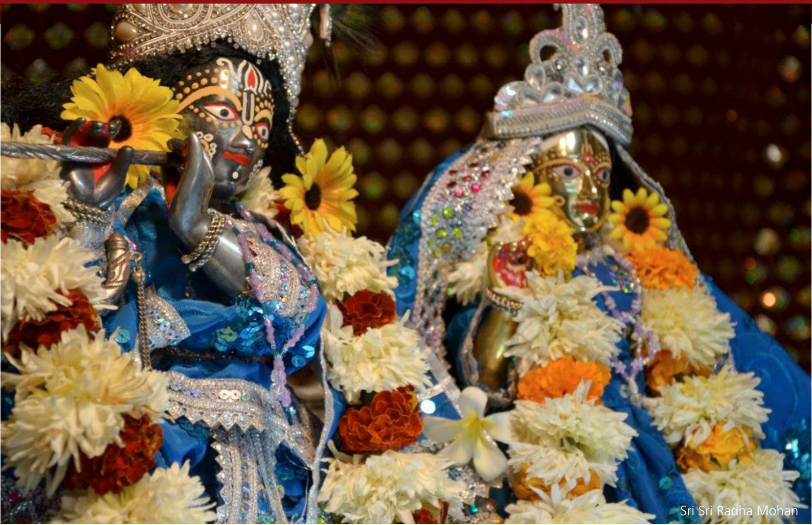
Sri Sri Radha Mohan

»We all need kripa, mercy. It is always there. Always available for everyone. Like rain. Rain is falling down on everyone. No matter if you are big, small, rich, poor. Rain will come to you. Same with mercy. It is always there. We need to have a useful container to receive this mercy. It should not have holes in it. The container is our heart. The heart should be made of humility. Then we can receive all mercy, like a good pot can receive the rain.«